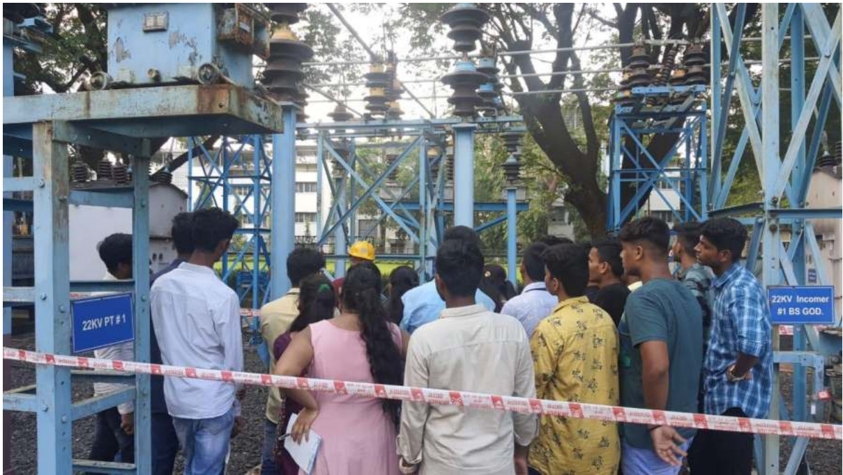
Industrial visit: Tata power skills Developments Institute, Shahad.