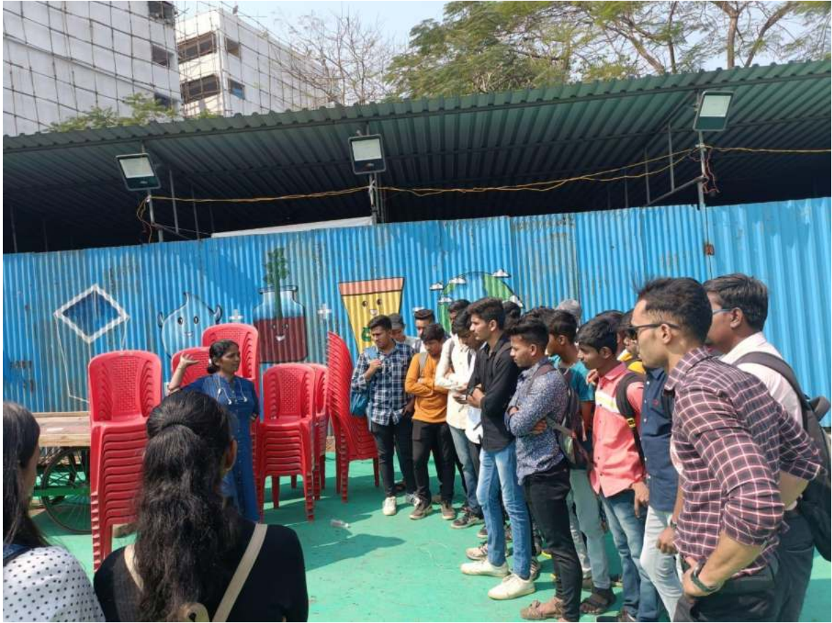
Industrial visit: Recycling plant, Kopari, Thane