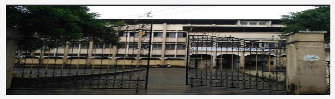
Approved by AICTE ,New Delhi recognized by DTE , Government of Maharashtra & affiliated to the Maharashtra state board of technical education, Mumbai.

To make it a center of character building and academic excellence.