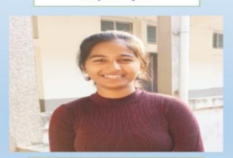
SY EJ 70.35%